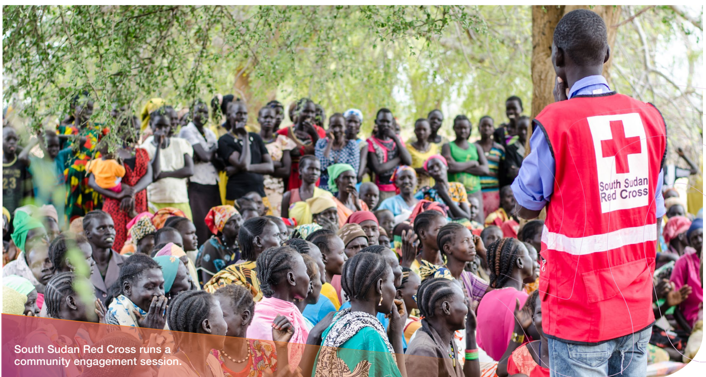
South Sudan Red Cross runs a community engagement session.

This research is a key element to advocate for and ultimately inform legal reform.