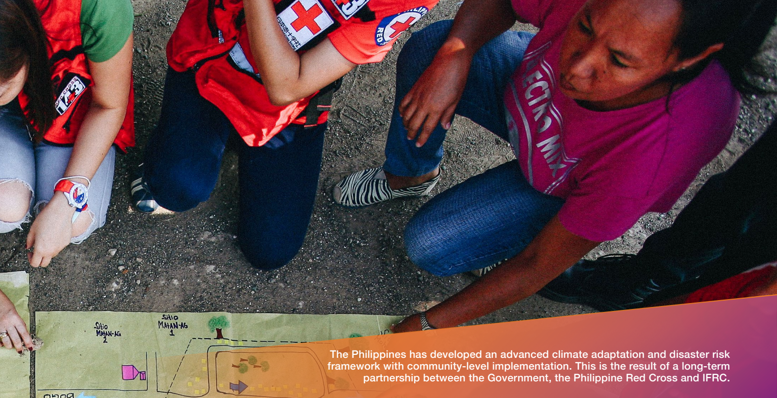
The Philippines has developed an advanced climate adaptation and disaster risk framework with community-level implementation. This is the result of a long-term partnership between the Government, the Philippine Red Cross and IFRC.

solutions are community-based solutions, and local actors, including Red Cross volunteers, should be at the core of its design and implementation.”