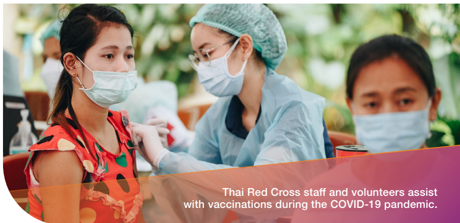
Thai Red Cross staff and volunteers assist with vaccinations during the COVID-19 pandemic.

“We considered how this emergency would be managed, as in many cases, health ministries managed