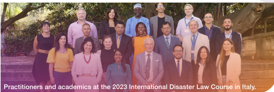
Practitioners and academics at the 2023 International Disaster Law Course in Italy.

Several online training courses on topics such as IDRL, law and disaster preparedness and response and law and disaster risk reduction have been developed to disseminate disaster law amongst National Societies, governments, academics and the general public. In 2023, IFRC Disaster Law, in partnership with the International Disaster, Emergency and Law Network (IDEAL), a global group of disaster law academics and experts, and with the support of the Italian Red Cross, launched the world’s first free online disaster law course, Law and Policies for the Protection of the Most Vulnerable , to increase knowledge of disaster law and how it can help save lives and keep communities safe in disasters.