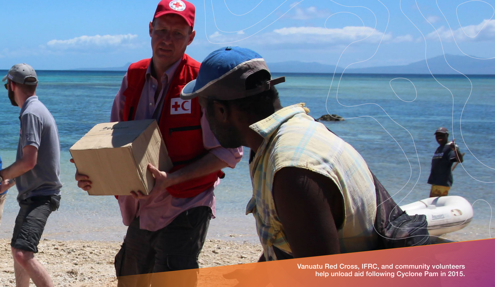
Vanuatu Red Cross, IFRC, and community volunteers help unload aid following Cyclone Pam in 2015.

Cross and IFRC Disaster Law was adopted. One of the objectives of this law was to facilitate the entry and coordination of international assistance, and it includes detailed procedures relating to requests for and offers of international disaster assistance as well as provisions for the coordination of international assisting actors. These provisions will help to avoid the influx of unsolicited and uncoordinated aid and assistance in large-scale disasters.