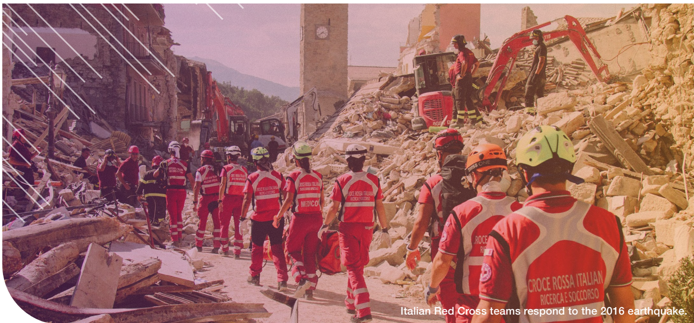
Italian Red Cross teams respond to the 2016 earthquake.