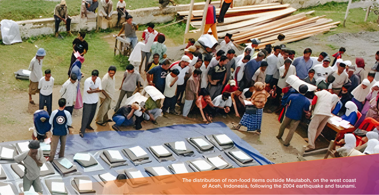
The distribution of non-food items outside Meulaboh, on the west coast of Aceh, Indonesia, following the 2004 earthquake and tsunami.

“One of my first tasks was defining international disaster law, what would be most useful and feasible at the time, thinking about how it might expand in the future, but we had to have a starting point.