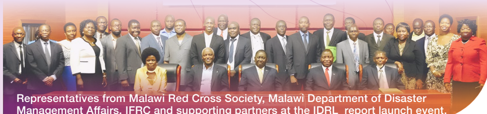
Representatives from Malawi Red Cross Society, Malawi Department of Disaster Management Affairs, IFRC and supporting partners at the IDRL report launch event.

The comprehensive approach to disaster risk governance is also being promoted at the regional level. IFRC Disaster Law is supporting the African Union in developing draft Model Act on Disaster Preparedness and Response in Humanitarian Contexts. The overarching aim of the draft Model Act is to facilitate the work of the African Humanitarian Agency, and it includes comprehensive provisions on international disaster assistance. In recognition of the importance of comprehensive disaster risk governance in the management of disaster risks faced in the region, the draft Model Act also includes provisions on the planning of disaster prevention and mitigation measures, as well as disaster preparedness, anticipatory action, enhancing disaster response capabilities, disaster displacement and recovery. ●