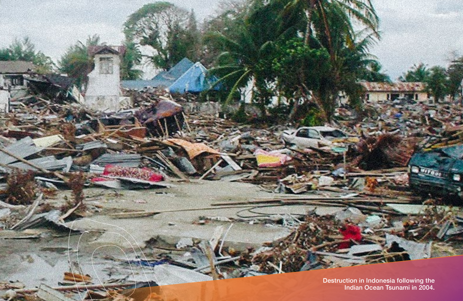
Destruction in Indonesia following the Indian Ocean Tsunami in 2004.

influenced state practice and gained considerable authority since their development. The Guidelines are still widely used by governments to prepare their disaster laws and plans to mitigate the common problems in international disaster response operations today. To date, the IFRC network has supported the implementation of the IDRL Guidelines in domestic instruments in 38 countries, with several adopting more than one instrument reflecting the recommendations of the IDRL Guidelines. The non-binding nature of the Guidelines promotes a flexible approach which allows states to incorporate them into their domestic legal and policy frameworks according to their national priorities and needs.