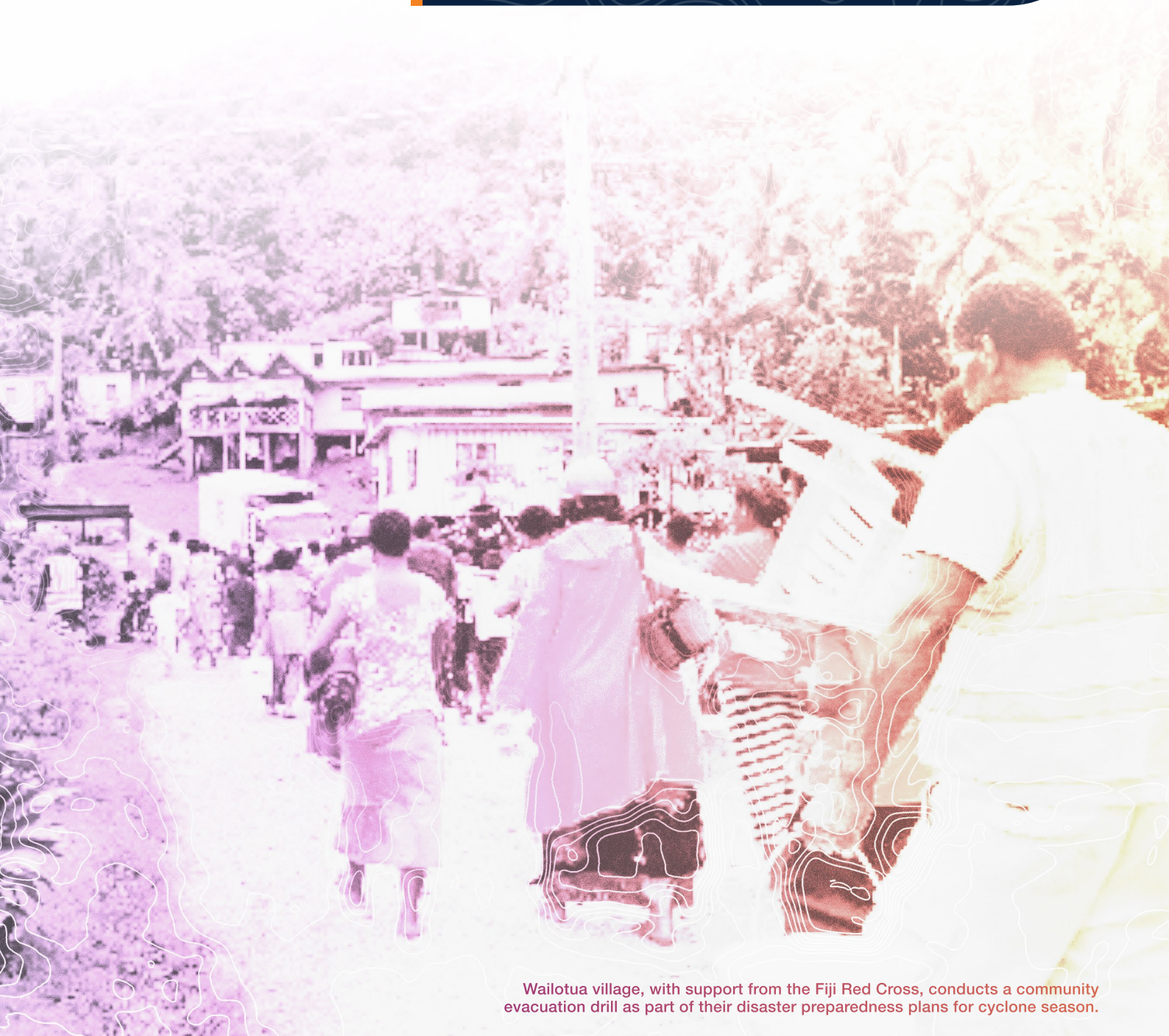
Wailotua village, with support from the Fiji Red Cross, conducts a community evacuation drill as part of their disaster preparedness plans for cyclone season.