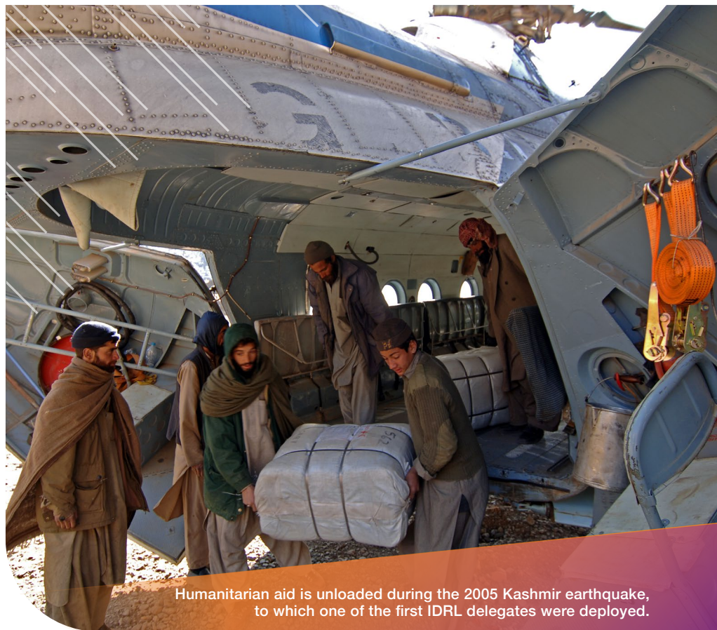
Humanitarian aid is unloaded during the 2005 Kashmir earthquake, to which one of the first IDRL delegates were deployed.