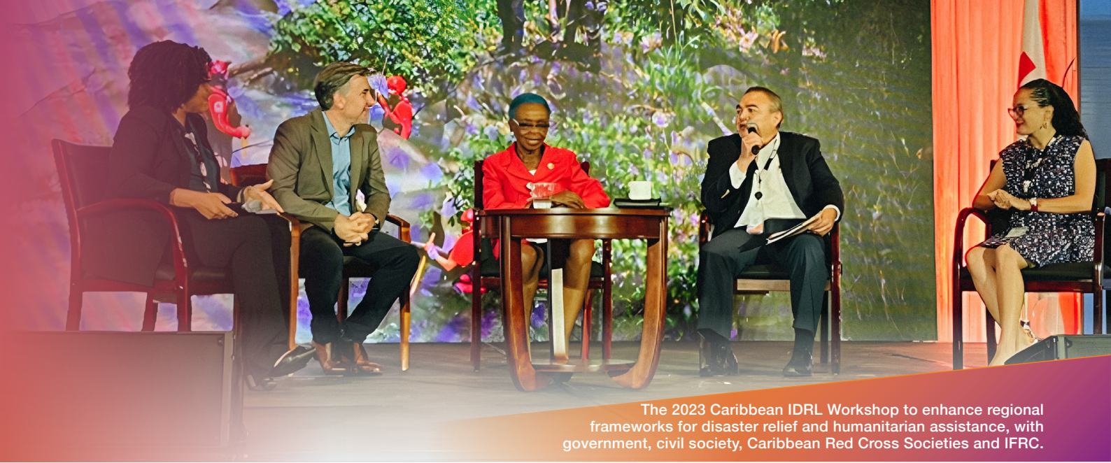
The 2023 Caribbean IDRL Workshop to enhance regional frameworks for disaster relief and humanitarian assistance, with government, civil society, Caribbean Red Cross Societies and IFRC.