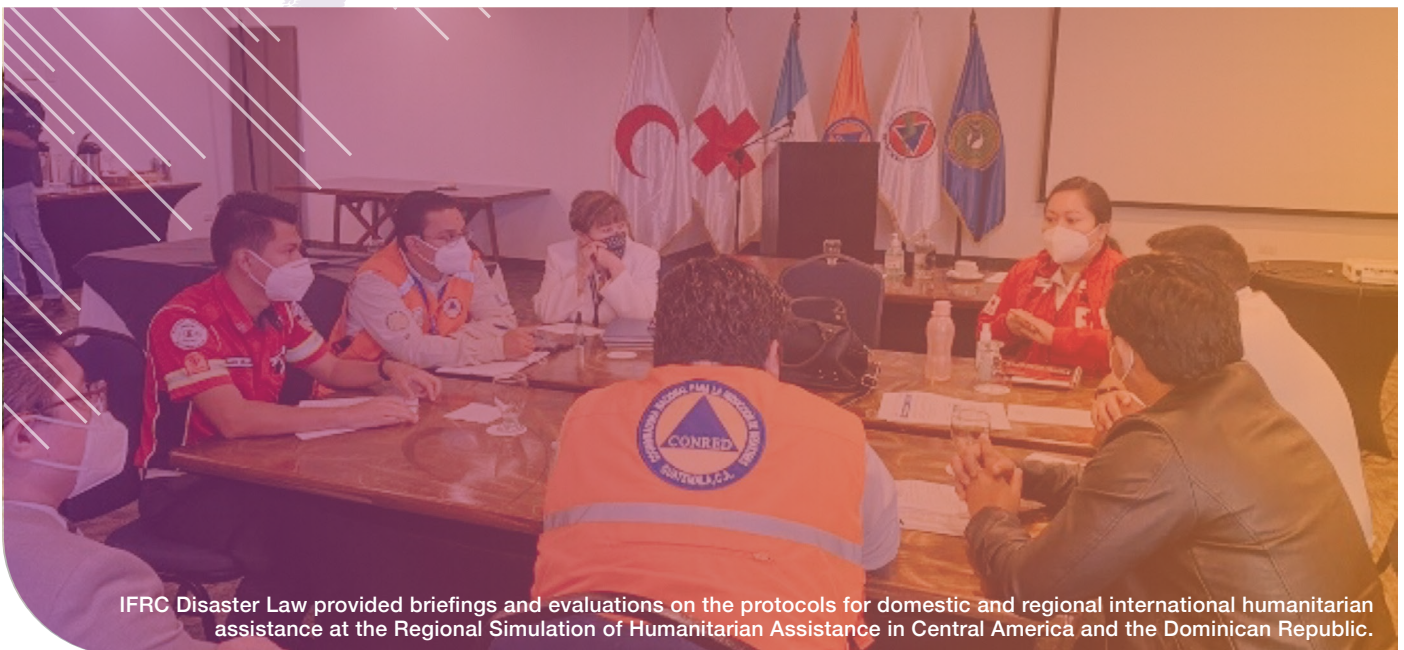
IFRC Disaster Law provided briefings and evaluations on the protocols for domestic and regional international humanitarian assistance at the Regional Simulation of Humanitarian Assistance in Central America and the Dominican Republic.

In Kyrgyzstan, to simplify the regulatory processes involved in the delivery and acceptance of international emergency assistance, the government has introduced