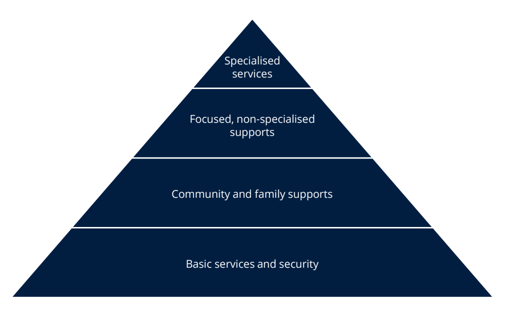
Intervention pyramid for MHPSS in emergencies, reproduced from the IASC MHPSS Guideline

As stated above, the third layer of the MHPSS pyramid is focused, non-specialised support including psychological first aid. At its core, psychological first aid entails providing humane and compassionate support to a person affected by a traumatic event. Psychological first aid is not a set of pre-determined actions. Instead, it entails listening carefully to the needs of affected people and linking them with information and practical support, with an emphasis on interacting with them in a way that instils hope and promotes feelings of safety, calmness, connectedness and self-efficacy. <sup>119</sup> In addition to psychological first aid, focused and non-specialised support may include more structured interventions designed to assist people to navigate common difficulties following an emergency or other traumatic event. There are several programs that have been developed for this purpose, including: PM+ (Problem management plus), developed by the World Health Organization; <sup>120</sup> Skills for Psychological Recovery, developed by the National Center for PTSD and the National Child Traumatic Stress Network in the US; <sup>121</sup> and SOLAR (Skills fOr Life Adjustment and Resilience), developed through an international collaboration between disaster and mental health experts led by Phoenix Australia – Centre for Posttraumatic Mental Health at the University of Melbourne. <sup>122</sup>