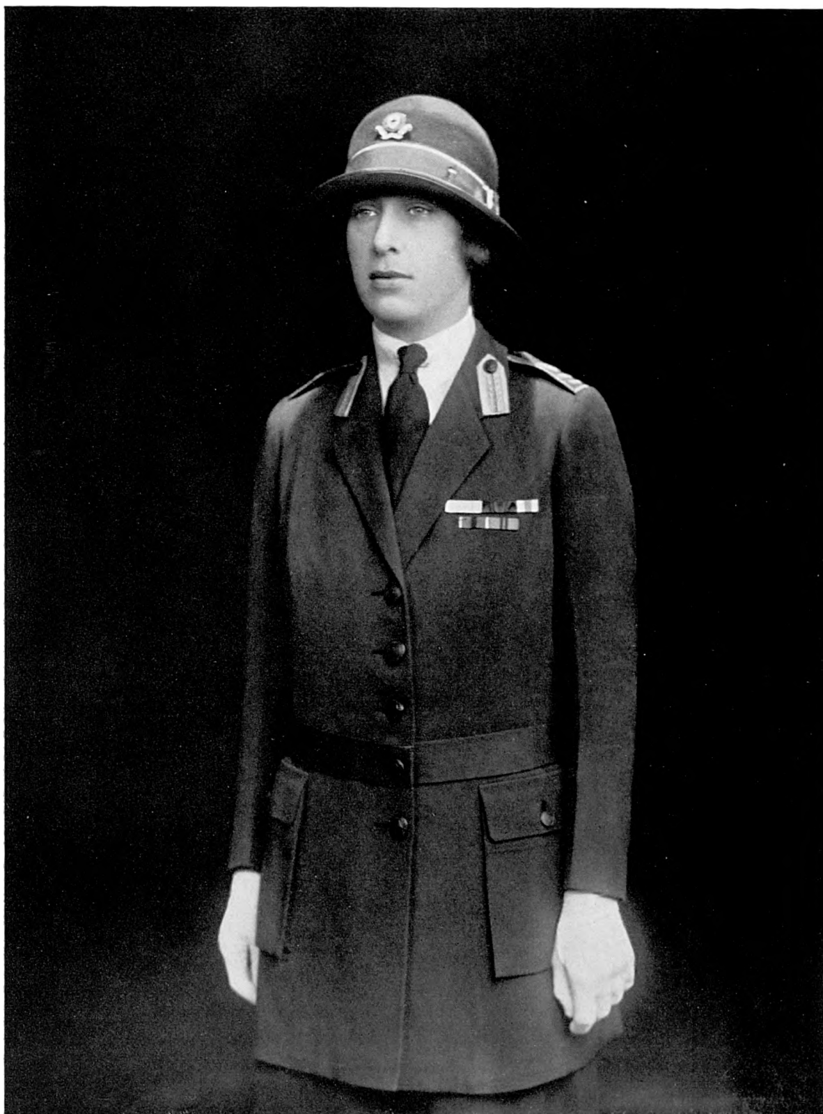
H.R.H. THE PRINCESS ROYAL. Commandant-in-Chief, British Red Cross Society Detachments.