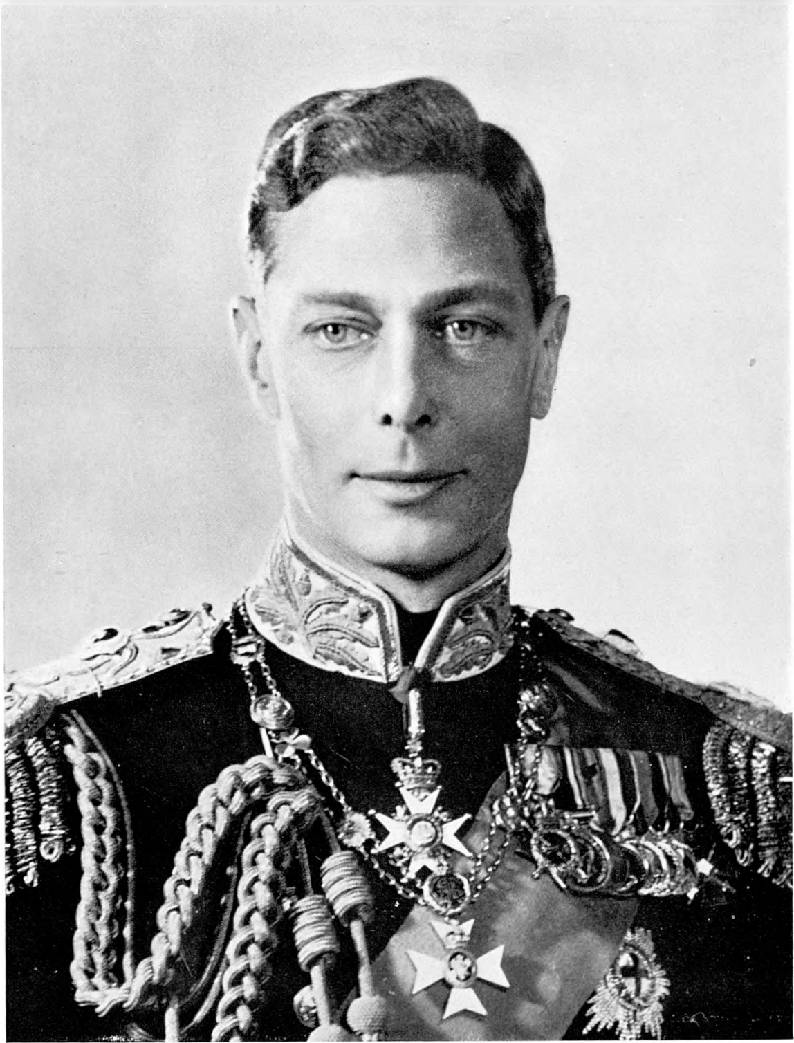
H.M. THE KING. Patron of the British Red Cross Society.