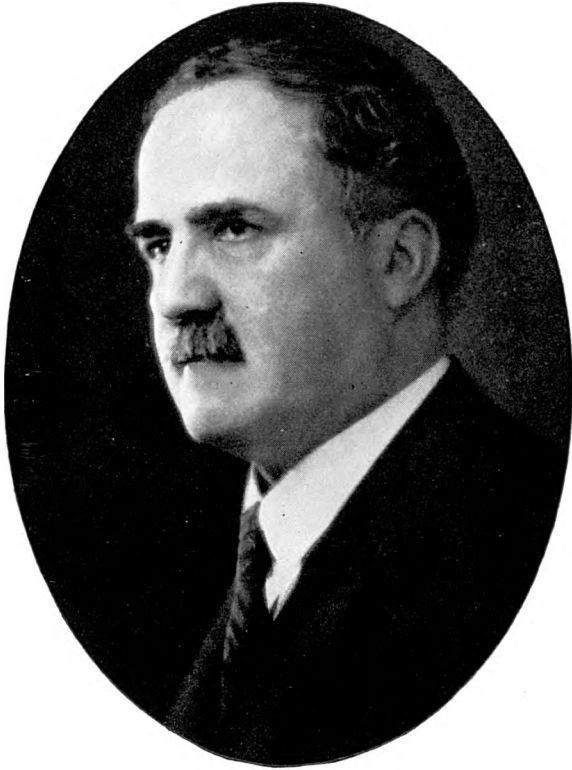
PROFESSOR MAX HUBER. President, International Red Cross Committee.