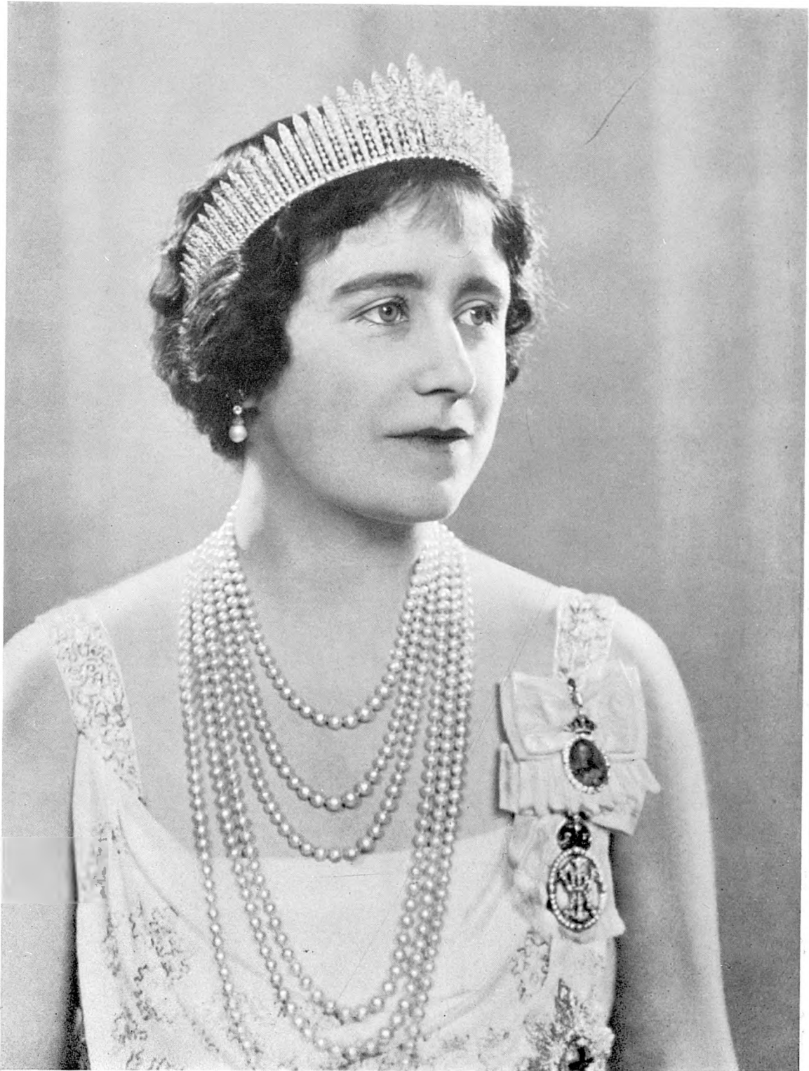
H.M. THE QUEEN. President of the British Red Cross Society.