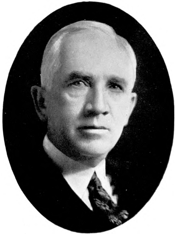
HON. NORMAN H. DAVIS. Chairman, Board of Governors, League of Red Cross Societies.