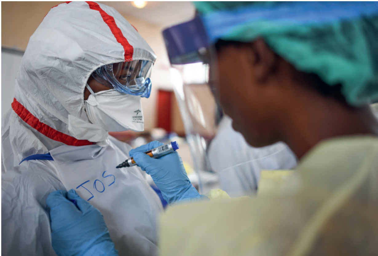
Democratic Republic of the Congo, 2018. The 2018 outbreak of Ebola was incredibly complex. It unfolded in a region affected by a two decades-long conflict that has claimed countless lives and deprived millions of even the most basic needs and services. More than 2 million people were screened at a variety of infection prevention and control sites. Wearing protective equipment can look intimidating to communities. Volunteers are writing their names to allow people to identify with someone behind the layers and masks.

IHR implementation, including developing National Action Plans for Health Security ( NAPHS ). However, JEEs are voluntary and there is no obligation on States to implement their findings. Moreover, the extent to which JEE teams can secure contributions from all relevant actors and stakeholders is not clear, and JEEs may not take into account States' wider disaster risk management ( DRM ) arrangements or the level of coordination and integration between PHE and disaster risk management frameworks and actors. Domestic implementation of the IHR could potentially be strengthened by making JEE (or another external evaluation process) mandatory, ensuring that all relevant actors and stakeholders can contribute to external evaluation, and requiring the development and implementation of post-evaluation plans.