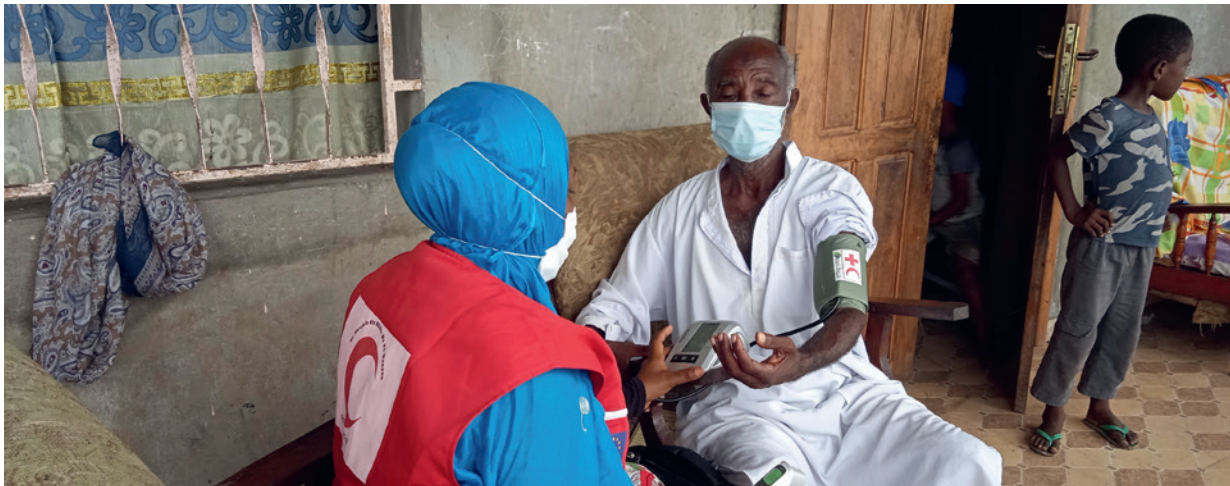
Comoros, 2021. Taking care of older people is essential as they are more vulnerable to COVID-19 and its side effects. Volunteers from the Comoros Red Crescent visit older people, talk with them and monitor their health status.

Recent developments in general DRM law are, however, moving towards the creation of duties to provide early warning of natural hazards and the occurrence of a disaster. 205 (Early warning as used here refers to taking action prior to a hazard materialising on the basis of risk information and warnings, rather than providing warnings only once the hazard materialises.) One of the seven global targets of the Sendai Framework is to substantially increase the availability of and access to multi-hazard early warning systems and disaster risk information and assessments. 206 The ILC Draft Articles for the Protection of Persons in the Event of Disaster propose a duty to install and operate early warning systems as part of the wider duty on States to reduce the risk of disasters. 207 In its commentary on the existence of a duty of cooperation in response to disasters, the ILC provides the example of a duty on an affected State “to inform or notify, at the onset of disaster, other States and other assisting actors that have a mandated role to gather information, [and] provide early warning”. 208