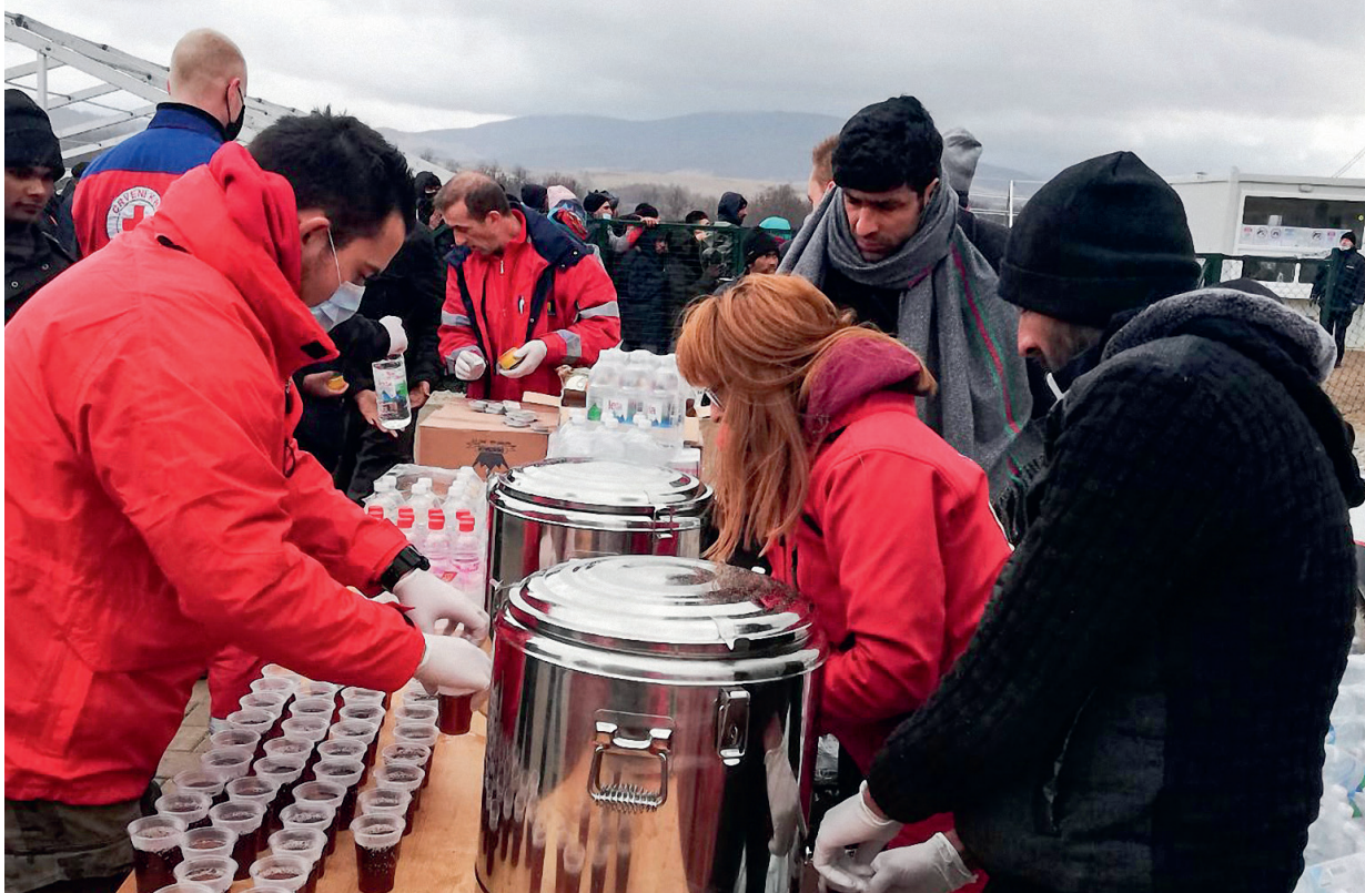
Bosnia and Herzegovina, 2020. Bosnia and Herzegovina Red Cross provides warm clothing, food, bedding and hot tea to migrants that were forcibly moved after the Lipa camp in the north west of the country burned down.

and certain special permit holders were eligible to claim the South African COVID-19 Social Relief of Distress grant. In New Zealand, a Foreign National Support Programme was established which could be accessed by foreign nationals unable to return to their home country due to COVID-19 restrictions. 496