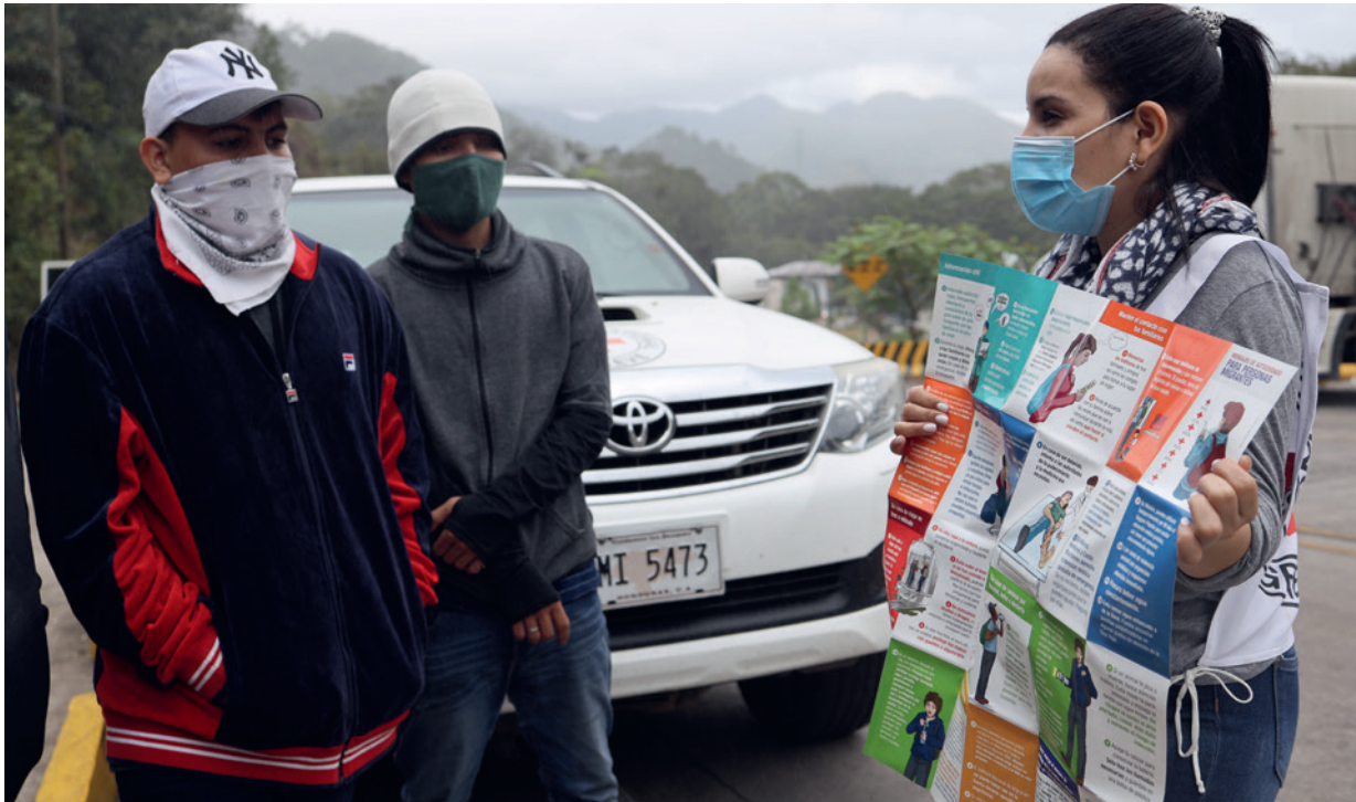
Honduras, 2021. The Honduran Red Cross provides support to migrants travelling through the country in a 'migrant caravan'. Humanitarian Service Points established along the migration route are used to provide essential services and supplies, such as water, face masks, pre-hospital care, and information about safety, security and COVID-19 prevention.

Initially, the focus was on securing the return of tourists, including those on cruise ships. As the COVID-19 Pandemic progressed, significant issues were then experienced with the repatriation of the crews of both passenger and cargo ships that, due to lack of business, were forced to lay up offshore. By July 2020, it was estimated that 200,000 seafarers were stranded at sea. 398 Difficulties with repatriating migrant workers also became apparent as the COVID-19 Pandemic progressed and the impact on their employment worsened: for example, Sri Lanka, which had over one million of its citizens working abroad before the COVID-19 Pandemic, had at one point more than 50,000 Sri Lankan citizens waiting to be repatriated. 399