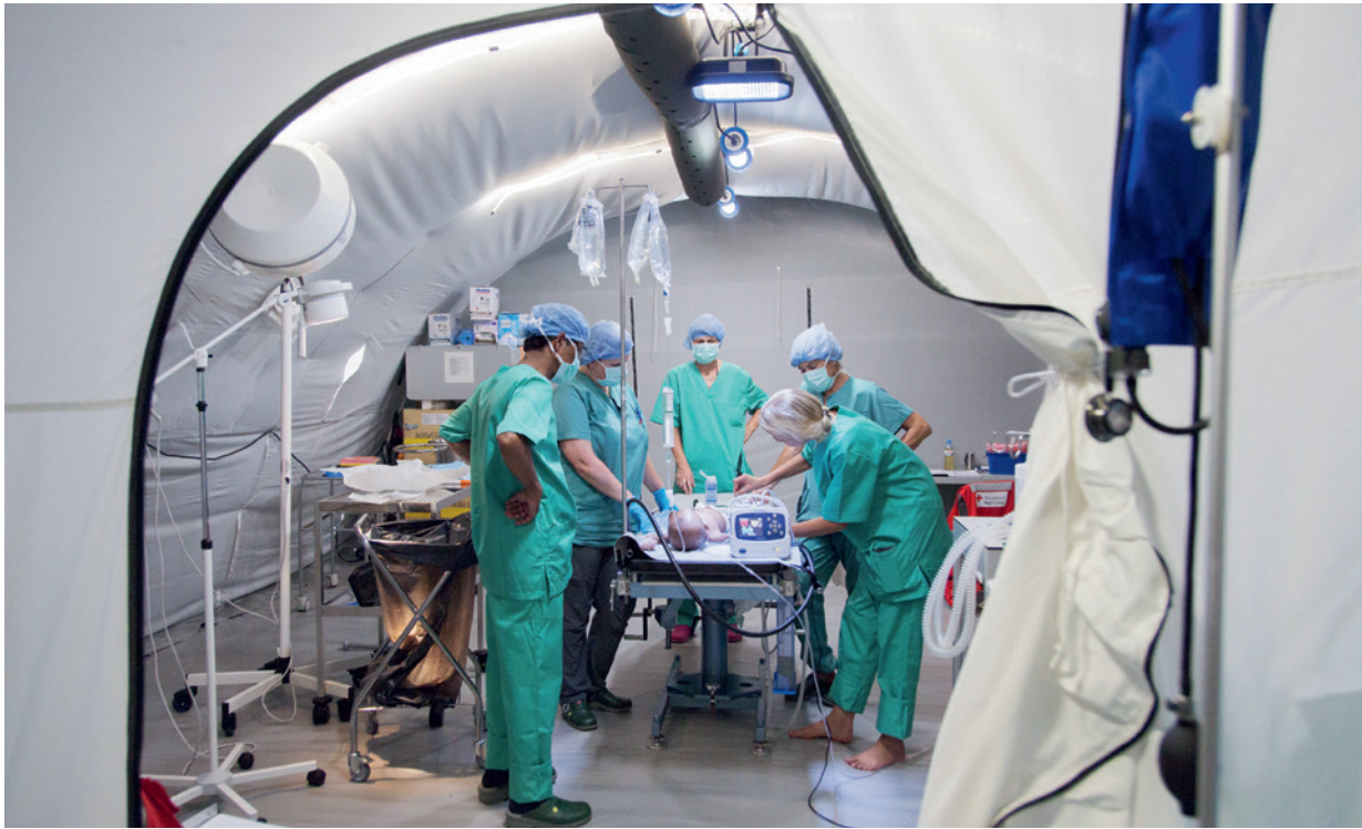
Bangladesh, Cox's Bazar, 2017. Finnish-Norwegian field hospital in the Rubber Garden, Kutupalong.

On the other hand, a number of initiatives waived pre-existing restrictions or facilitated the movement of goods and equipment. The WTO Trade Facilitation Agreement (TFA), for example, contains provisions expediting the movement, release and clearance of goods and those in transit. The UN Conference on Trade and Development (UNCTAD) urged countries to address trade facilitation. 561 At the regional level, initiatives are reported, such as the Sistema de la Integración Centroamericana, established to expedite or facilitate the transit of humanitarian relief items shipped by land across all seven Central American states and the Central American Protocol for the Shipment, Transit and Reception of Humanitarian Assistance.