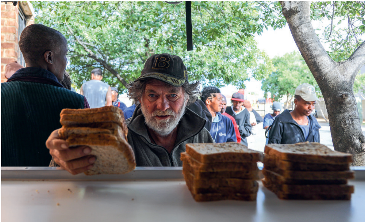
South Africa, 2020. South African Red Cross Society COVID-19 activities in Bloemfontein, Free State include a variety of initiatives such as mobile kitchens, social grants, screening, and testing and tracing. In Ricklands, the Bloemfontein branch have set up a shelter for homeless people at the Rocklands Hall, where they also provide meals from breakfast to dinner.

In contrast to the measures introduced to assist homeless persons, all these measures required legislation. However, most measures appear to have been reactive with little or no standing legislation enabling this action to be taken by governments. As a result of COVID-19, more legislation will now be in place, but the PHE Mappings suggest much of the legislation is specific to COVID-19 and would, therefore, not automatically applicable to a future PHE. Again, given that similar support may be required in future PHEs, it would be sensible for States to secure standing powers to take such action and to ensure that the type of arrangements required are included in laws, policies and/or plans for PHEs.