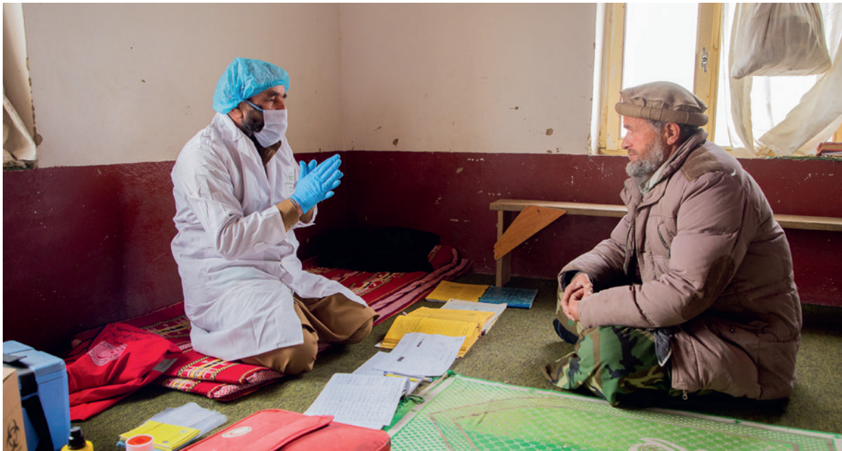
Bagram, Afghanistan, 2020. Afghan Red Crescent Society's Parwan branch mobile health team educates local community members on how to prevent spreading COVID-19 and other diseases.

While it is not possible to state that integration requires one particular type of domestic legal framework, it can be said that integration requires an absence of gaps, conflict, inconsistency or unnecessary duplication between the powers, roles, responsibilities and other arrangements created by PHE and DRM instruments. The fact that hybrid frameworks appear to be the most common type of arrangement underlines the importance of conducting reviews to assess whether any such issues exist and, if so, how they can be resolved to achieve greater integration.