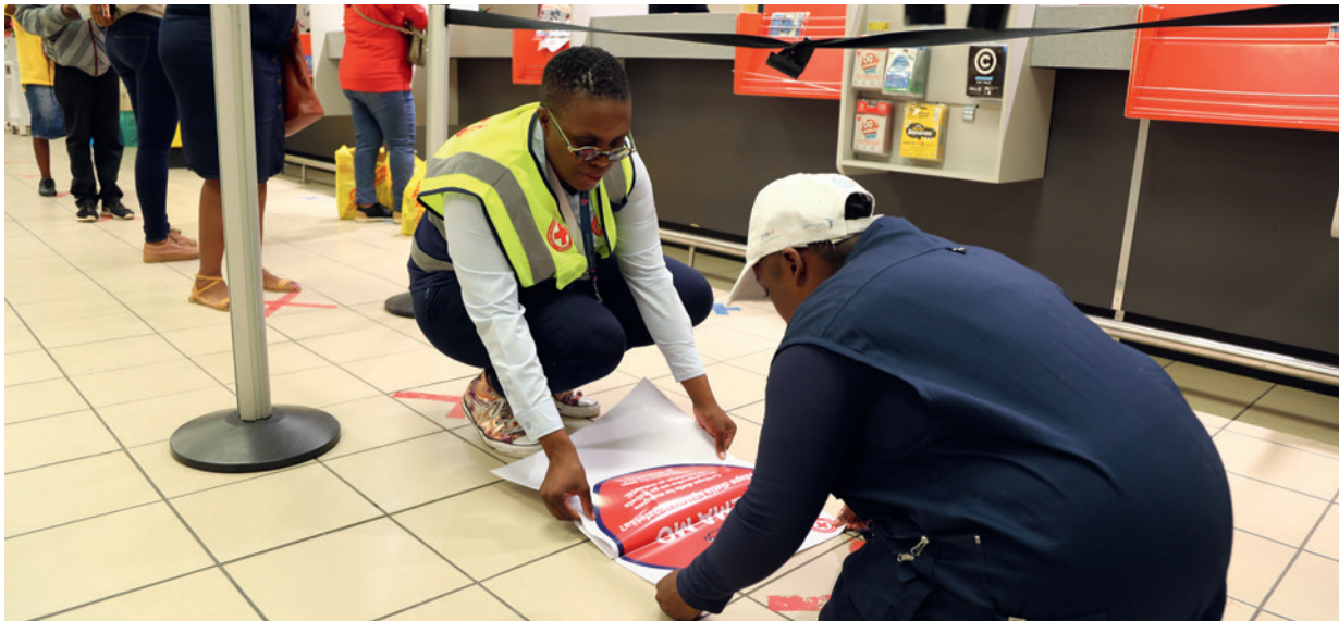
South Africa, 2020. Volunteers at the Twin City Mall explain how to curb the spread of COVID-19, starting with social distancing and the importance of washing hands regularly.