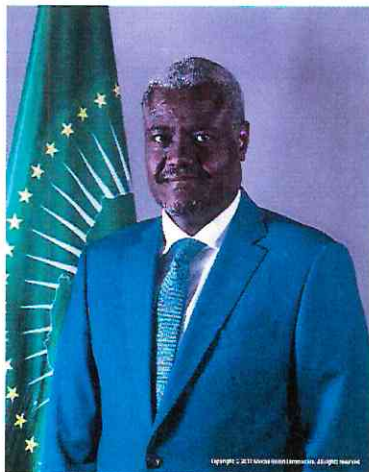
H.E. Moussa Faki Mahamat Chairperson African Union Commission

Over a decade ago, Africa developed an African strategy for Disaster Risk Reduction (DRR). The strategy did not only contribute to the Hyogo Framework for Disaster Risk Reduction (2005-2015) but led to positive developments on DRR on the continent.