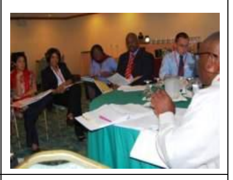
The Caribbean's first IDRL workshop in Barbados, in October 2011.