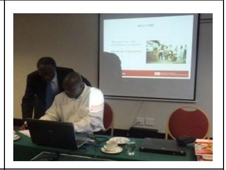
IDRL workshop in Windhoek, Namibia, in November 2011.