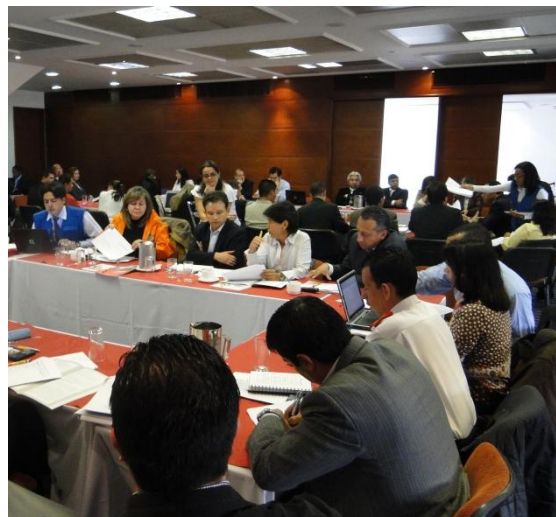
Participants at a Colombia Red Cross workshop on IDRL in Bogota.

This report covers the period 1 January to 31 December 2010