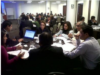
IDRL project working group in Lima, Peru IFRC

Outcome: Policy-makers understand and make use of the IDRL Guidelines to strengthen legal and policy frameworks for disaster response.