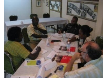
IDRL forum in Honiara, Solomon Islands IFRC