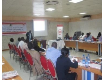
IDRL workshop in Kampala, Uganda IFRC