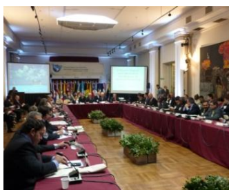
Humanitarian conference in Buenos Aires IFRC