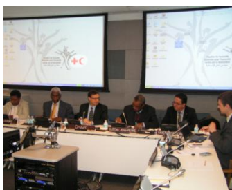
IDRL and Haiti panel at the UN in New York

Outcome: The IDRL Guidelines are well known, partnerships are developed and the knowledge base of the Movement on legal issues in disaster response is deepened.