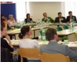
IDRL workshop in Vienna, Austria IFRC

Outcome: Interested National Societies and other partners are empowered to advocate for strengthened legal frameworks for disaster response.