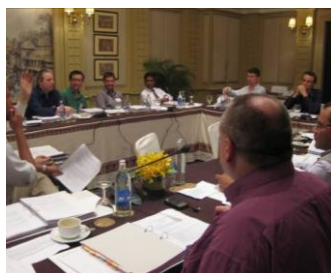
IDRL workshop in Bangkok, Thailand IFRC