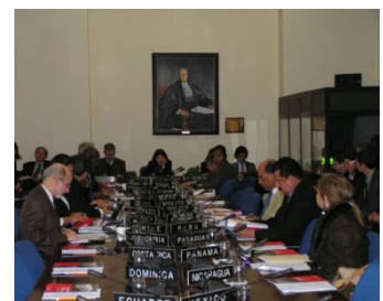
IDRL session for the OAS, Washington, USA IFRC