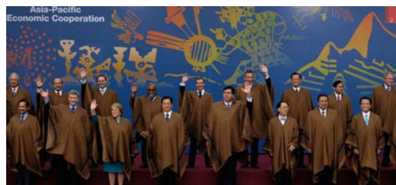
APEC's Economic Leaders approved a new disaster management strategy which refers to the IDRL Guidelines. Asia-Pacific Economic Cooperation (APEC)

Goal for 2008-09: Intergovernmental and regional forums will take note of the IDRL Guidelines and encourage their members to use them.