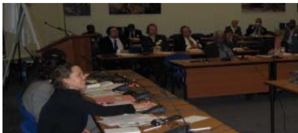
In September, participants at the annual National Societies legal advisors meeting provided further input.