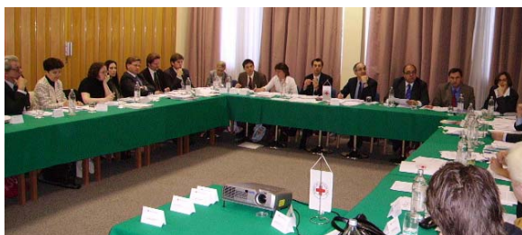
European Legal Support Group, Cavtat, Croatia, April 2008.