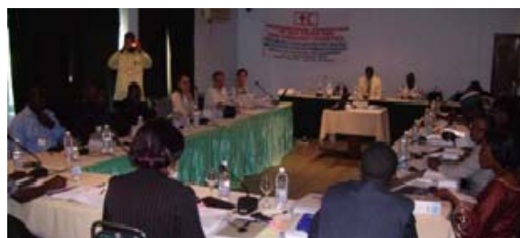
Abuja, Nigeria (Nov 26-28).

Goal for 2008-09: Organize eight subregional workshops on legislative advocacy for National Societies.