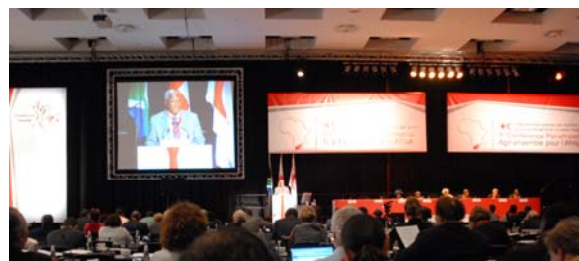
Pan African Conference, Johannesburg, South Africa, October 2008.