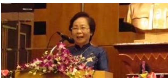
At an August partnership meeting of the Vietnam Red Cross Society, Vice-President of Vietnam, Mme Nguyen Thi Doan, affirmed the State's commitment to creating the most favourable conditions and the best legal framework for humanitarian activities.