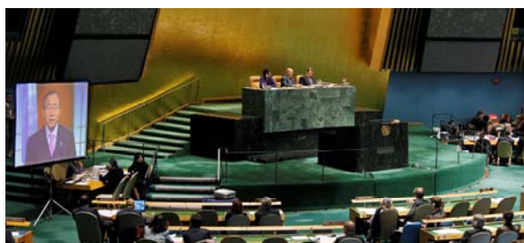
The 63 rd UN General Assembly adopted multiple resolutions citing the IDRL Guidelines.