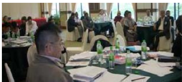
Kuala Lumpur, Malaysia (Nov. 13-14). International Federation/A. Amin