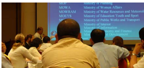
At a July meeting on disaster management in Vientiane, governmental and international representatives identified the need to revise Laos' legal framework for disasters. The International Federation's pilot project will support this effort.

Goal for 2008-09: Working in conjunction with interested National Societies, undertake 10 country-level technical assistance projects on the IDRL Guidelines for interested governments.