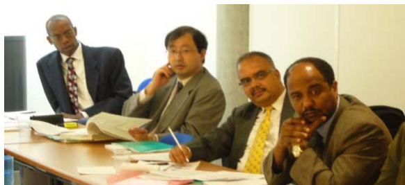
Participants at the May National Society reference group meeting set out the initial concept for the manual.

Goal for 2008-09: Develop a manual for National Societies to assist them in providing advice to their governments on the drafting of effective disaster management legislation.