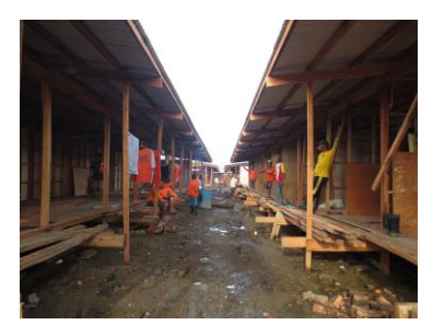
Construction of bunkhouses in the Philippines following typhoon Haiyan

The database grew to 1030 records, including international instruments, national laws and key articles. In addition, as noted above, a new <u>database</u> of disaster law courses was developed.