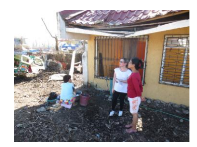
Addressing HLP issues with the Shelter Cluster in Leyte Province, Philippines.