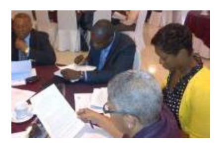
IDRL workshop in Kingston, Jamaica examines study conclusions

The following chart sets out the DLP's specific objectives with quantitative targets, as appropriate. Note that the targets are expressed for the two-year period of 2013-14 and were set based on full funding of the original global and zone-level DLP budgets.