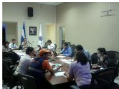
Simulation exercise in Honduras to test the effectiveness of regional mechanisms disaster assistance.