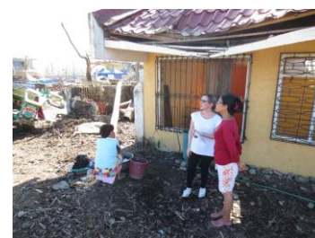
Addressing HLP issues with the Shelter Cluster in Leyte Province, Philippines.