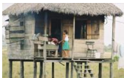
DRR law study in Nicaragua