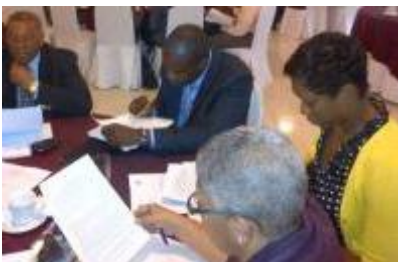
IDRL workshop in Kingston, Jamaica examines study conclusions

The following chart sets out the DLP's specific objectives with quantitative targets, as appropriate. Note that the targets are expressed for the two-year period of 2013-14 and were set based on full funding of the original global and zone-level DLP budgets.