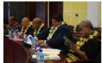
Tongan cabinet approves IDRL project