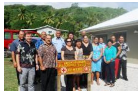
Participants of a disaster law workshop in the Cook Islands.