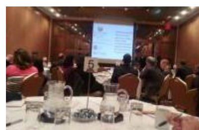
Workshop for New York diplomats on IDRL and humanitarian coordination