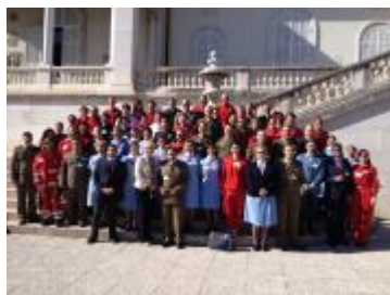
Italian Red Cross volunteer training on IDRL at the Institute of International Humanitarian Law in San Remo