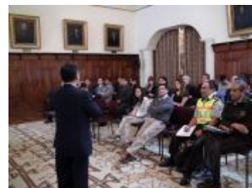
IDRL presentation in Ecuador