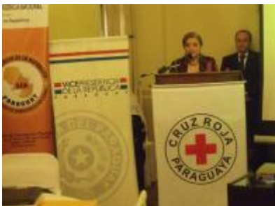
First Lady of Paraguay addresses participants at an IDRL workshop.

Initial consultation was also had on the potential value of developing a collection of country snap-shots on housing, land and property and related legal issues in shelter response. This included a discussion session at the shelter coordination workshop mentioned above.