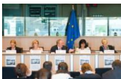
IDRL panel at the EU Parliament in Brussels