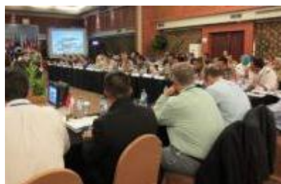
Exercise in West Sumatra addresses IDRL issues