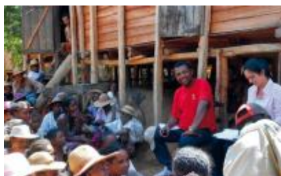
Community consultation during the DRR law study in Madagascar