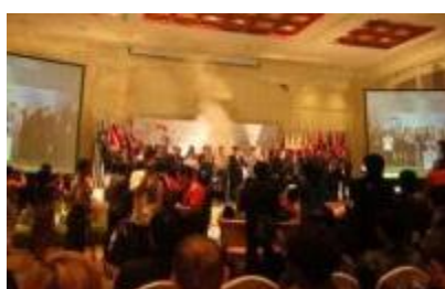
ASEAN disaster relief exercise addresses IDRL issues