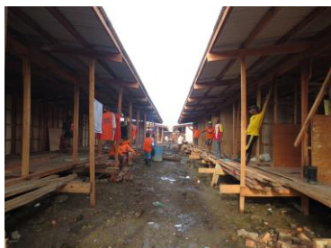
Construction of bunkhouses in the Philippines following typhoon Haiyan

The database grew to 1030 records, including international instruments, national laws and key articles. In addition, as noted above, a new database of disaster law courses was developed.