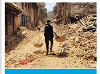
Rapid tenure assessment Guidelines for post-disaster response planning Pilot version

www.ifrc.org Saving lives, changing minds. IFRC International Federation of Red Cross and Red Crescent Societies