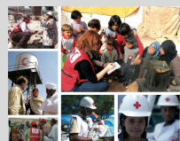
Minimum standard commitments to gender and diversity in emergency programming Pilot version

www.ifrc.org Saving lives, changing minds. IFRC International Federation of Red Cross and Red Crescent Societies