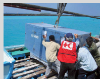
Introduction to the Guidelines for the facilitation and regulation of international disaster relief and initial recovery assistance

www.ifrc.org Saving lives, changing minds. IFRC International Federation of Red Cross and Red Crescent Societies