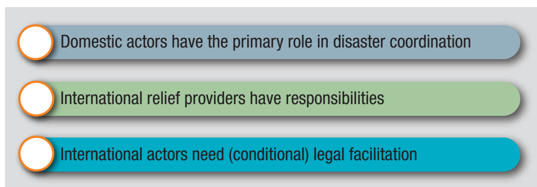
Figure 1.2: Key principles that inform and are reflected in the IDRL Guidelines.

Thus, the guidelines set principles for both the demand and supply side of the disaster relief chain. Figure 1.2 identifies some fundamental principles underlying the IDRL.