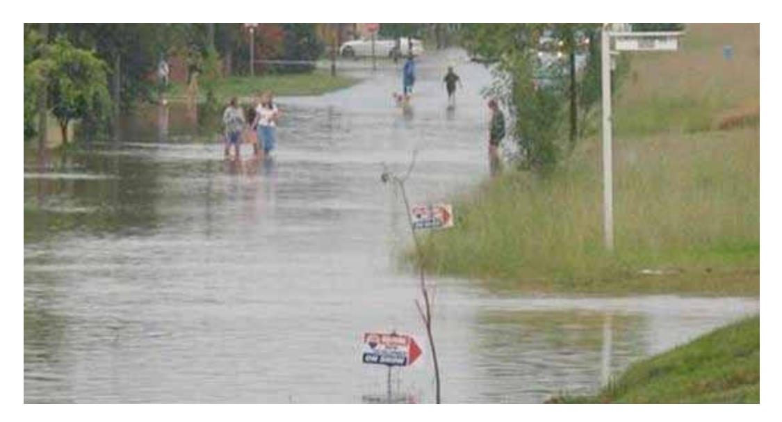
Illustration 1: An area in Atlasville during a flood event experienced in 2006.

In the Cape Town metropolitan municipality in the Western Cape Province<sup>104</sup> the land on which the Kosovo community is currently located was covered, in 1994, with dunes and wetlands and was home to only a few informal residents residing on its western border. The first planned land invasion took place in 1994 with a second larger mass invasion occurring in 2009. In little more than 10 years, the area is now a densely-populated informal settlement.<sup>105</sup> In their research in the Kabokweni Location, Gustafsson and Larsson found that the almost complete lack of land use planning and implementation of controls confounded reducing the risk factors of communities. They found that: