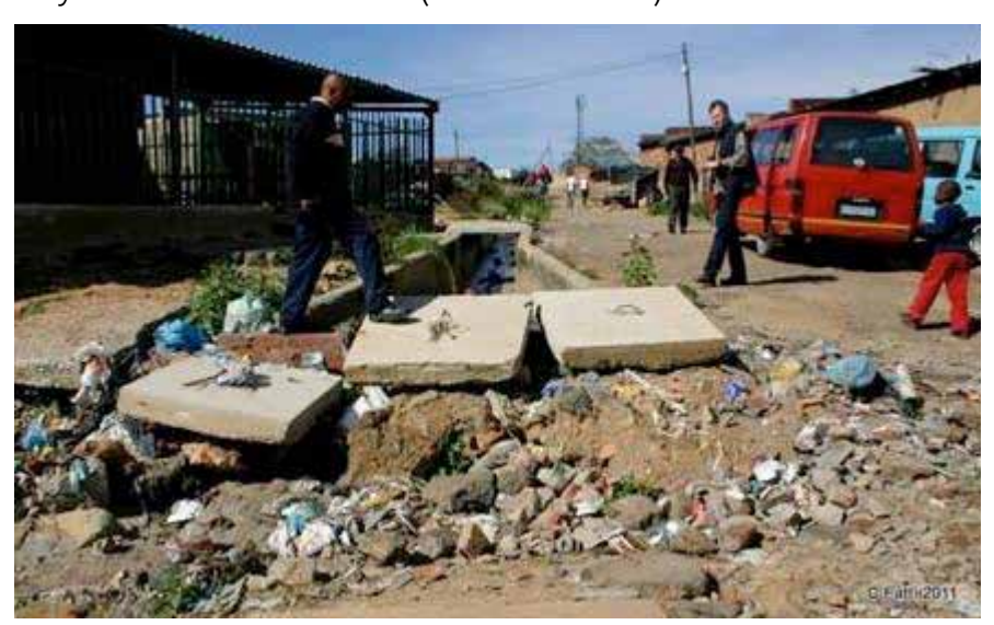
Illustration 3: A dilapidated storm water drain in Tembisa, full of litter and poorly-maintained (but only 6 months old). (Photograph courtesy of Christina Fatti).

A further problem in this area is that solid waste is not picked up efficiently, or at all. The practice in the community is for individuals to drop off a small bag of solid waste at the place where they wait for taxis to transport them to work in the morning. This, however, often tends to occur close to a stream or storm water culvert. The stream becomes polluted and the culverts blocked, which increases the risk of flooding from only a small amount of water (see illustration 3).