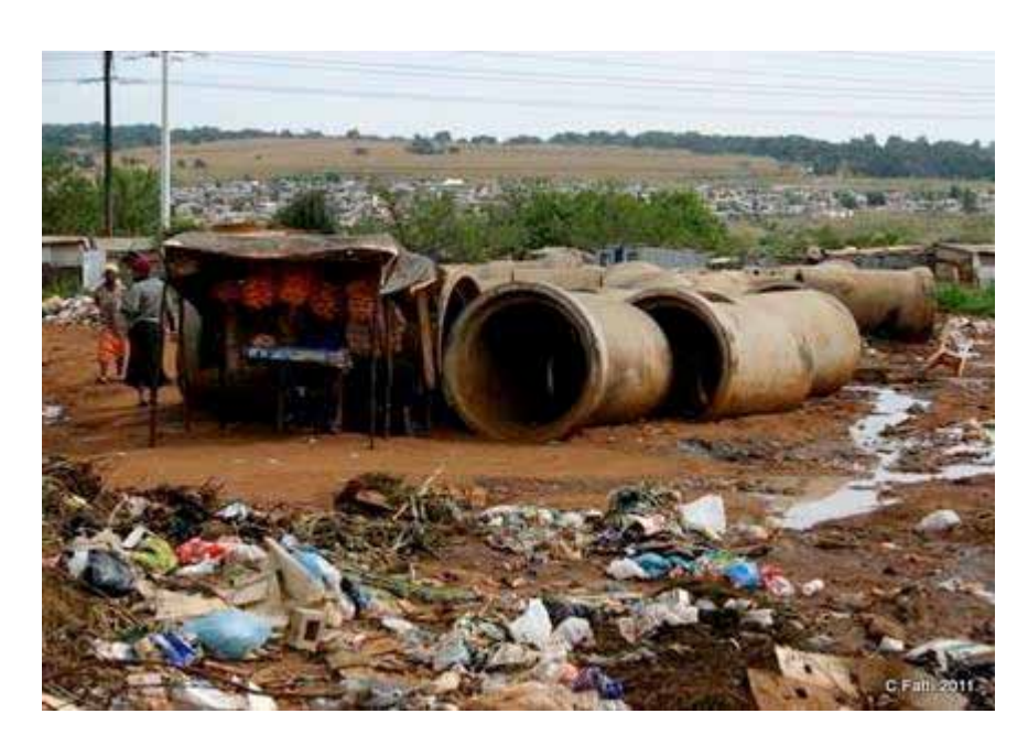
Illustration 2: Abandoned storm water pipes in Tembisa from uncompleted storm water system, abandoned due to resistance from community to move.

A further problem in this area is that solid waste is not picked up efficiently, or at all. The practice in the community is for individuals to drop off a small bag of solid waste at the place where they wait for taxis to transport them to work in the morning. This, however, often tends to occur close to a stream or storm water culvert. The stream becomes polluted and the culverts blocked, which increases the risk of flooding from only a small amount of water (see illustration 3).